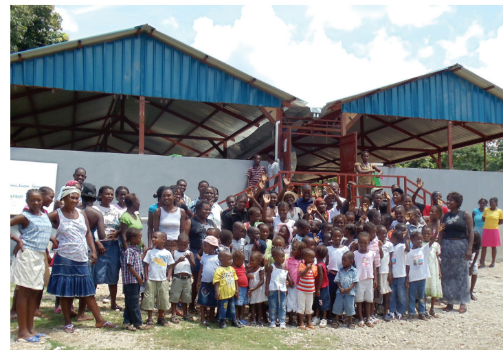
Students, parents, and teachers at recently completed Caboïs Community School.

Your generosity made it possible to do lots in a short time. With your support in the coming year, we will complete Learning Centers for three of our partner schools—equipping them with electricity, internet, and computer labs; presenting student-centered teaching training; and providing seed money to help communities create small businesses to cover school expenses.