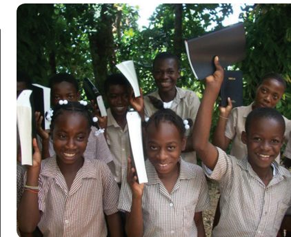
Students at Lalo Community School celebrate receiving Bibles.

In the coming year—with your support—we will continue these efforts and launch a scholarship program to enable top Haitian church leaders to receive education at a Haitian seminary. During this time when our churches have seen staggering losses, it has been a privilege to work with people so committed to the gospel of grace. These dear friends continue to focus on hope for a better future.