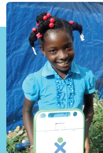
Lordz with the laptop she loves.